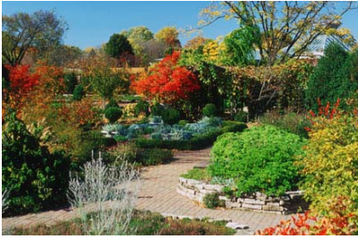
Path at Olbrich Botanical Gardens in which Bob's bricks are placed.