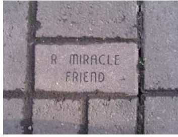
Picture of the Eagle memory brick in the path.