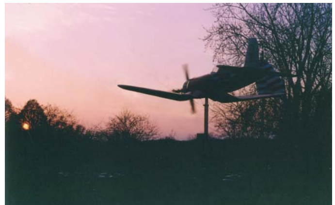
Gallery of Aviation Flies into the sunset.