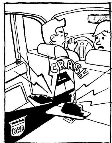
Wow Dad, you stopped to fast! "And they say the tail always survives."